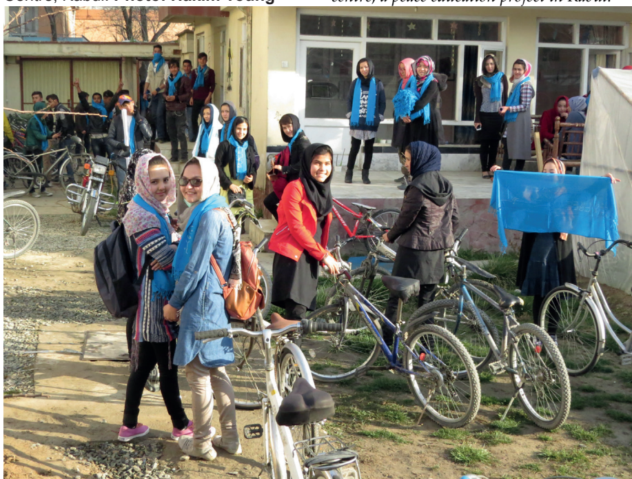
Below: Young women gather for a gender-free bike ride at the Borderfree Centre, Kabul.

In the Salvation Army, the pastors, or 'officers' as they are called, had an animated 'sharing song' for the children. It was not the kind of style you would find in an Orthodox or Catholic Church, but it was used for youngsters in a family prayer moment. Yes, I sang along with the easy rhythm of the song, and the YouTube video caught on with some of the younger ones and elders. It reminded me that 'learning to share' is something we instinctively teach children. My grandparents certainly did not want us to grow up selfish or greedy. 'Be happy with what you have' and 'share with people