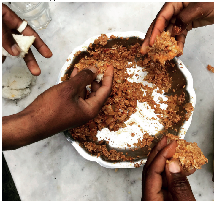
Left: At Maria Skobtsova House, shared Eritrean breakfast of Fata, hot tomato sauce and bread