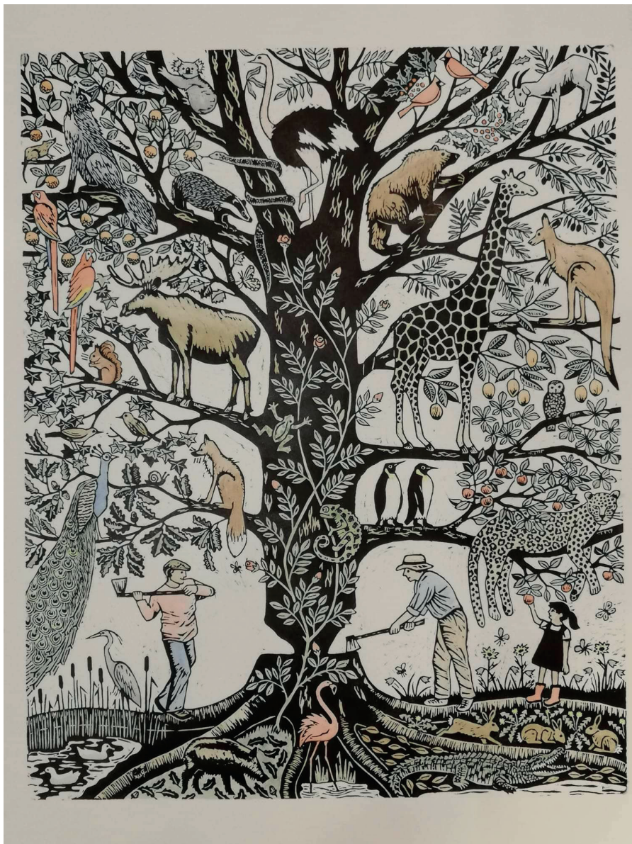
Left: The Tree of Life - 6th Mass Extinction, by Nat Morley.

In contrast, any solution – ethical or practical – to the present crisis must come from the understanding of humanity not as separate from, but intrinsic to, the earth's ecosystem. We are animals among many, and our experience is a shared one. When we destroy them, we destroy ourselves. The difference is that we have a choice in this – and so a moral imperative.