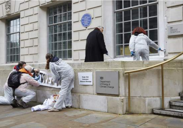
Christian Climate Action at the Department of Energy and Climate Change, Whitehall left : whitewashing the sign and kneeling in prayer right : stencilling the words Extreme Climate Change and whitewashing the building