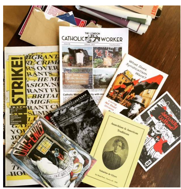
The London Catholic Worker joins some of the other 'zines' on sale at the London Anarchist Bookfair

This autumn the community has been active in hosting talks, workshops and celebrations. Catholic Workers ran a stall at the London Anarchist Bookfair, during which Nora Ziegler gave a seminar on 'radical hospitality'. The participants discussed the possibility of radical response to the growing number of refugees and the securitisation of borders in Europe. The seminar investigated the role of hospitality in organising in solidarity with refugees and migrants. But also discussed were the dilemmas around donating to the camp in Calais, where many volunteers are hard pressed, but which might also be attracting 'misery tourism'. Some stressed the importance of building community with the inhabitants at the camp, even for a short time, while others pointed out that, for some individuals, it would be the first time that they had taken part in an alternative, political project which has to be a positive thing.