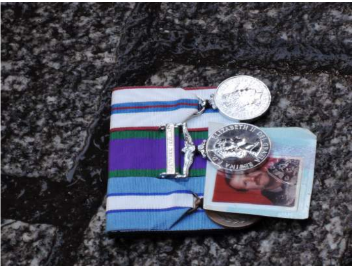
Four veterans left their service medals outside Downing Street on December 8th

Staying behind to photograph the medals on the ground, that looked so tiny, [continued on page 6]