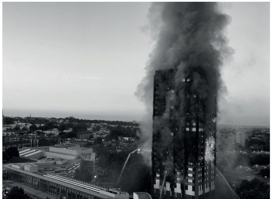
Grenfell Tower.

The community leaders, refugees from Eritrea, Sudan, Somalia, and Black British descendants of migrant workers from the Caribbean in the 1950s, had little choice but to live crowded together in Grenfell Tower. They tried to warn the wealthy landowners and their exclusively white representatives at the local council, that the building was unsafe, that their desperate living conditions made them feel discarded: 'No one listened to us,' one of the leaders said, 'No one here is rich, so no one thinks we are important.'