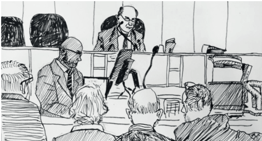
DSEI activist in court to plead not guilty.