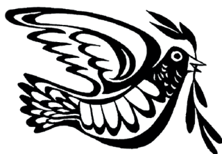
DOVE BY RITA CORBIN