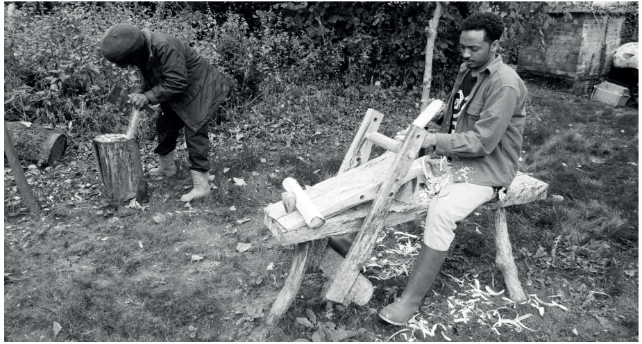
Guests from our house doing woodwork at the Grange.

Another big event on our calendar was the annual London Anarchist Bookfair, a gathering of diverse groups with similar commitments