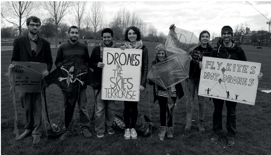
Fly Kites not drones crew & pic-nic (below)