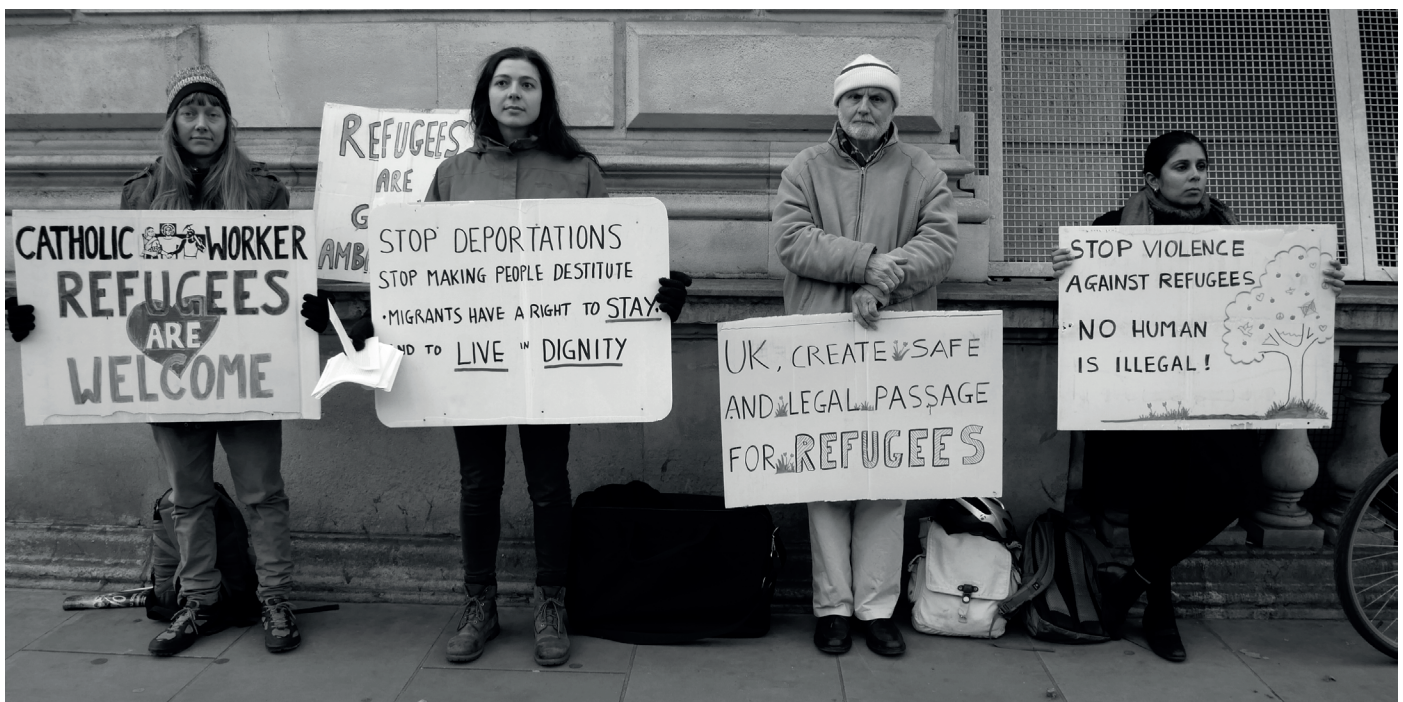
Members of the London Catholic Worker at our monthly vigil outside the Foreign Office.

Personalism shifts responsibility for the rights of the person from the state to the individual. The dignity of the person rests on their unique subjectivity and ability to love others, freely and at a personal sacrifice. The person is fulfilled by caring for others. This means it is my own dignity that