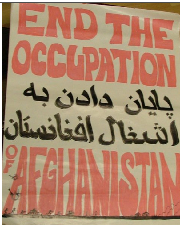
One of the placards from the Pentecost witness