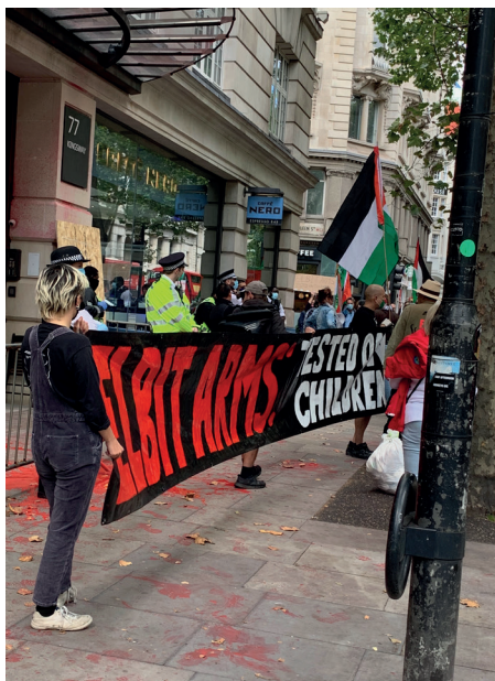
Above: 'Elbit arms: tested on children' Street protest outside the offices of Elbit Systems in London. Red paint, symbolising the blood spilled in Palestine, is visible on the pavement and the front entrance.