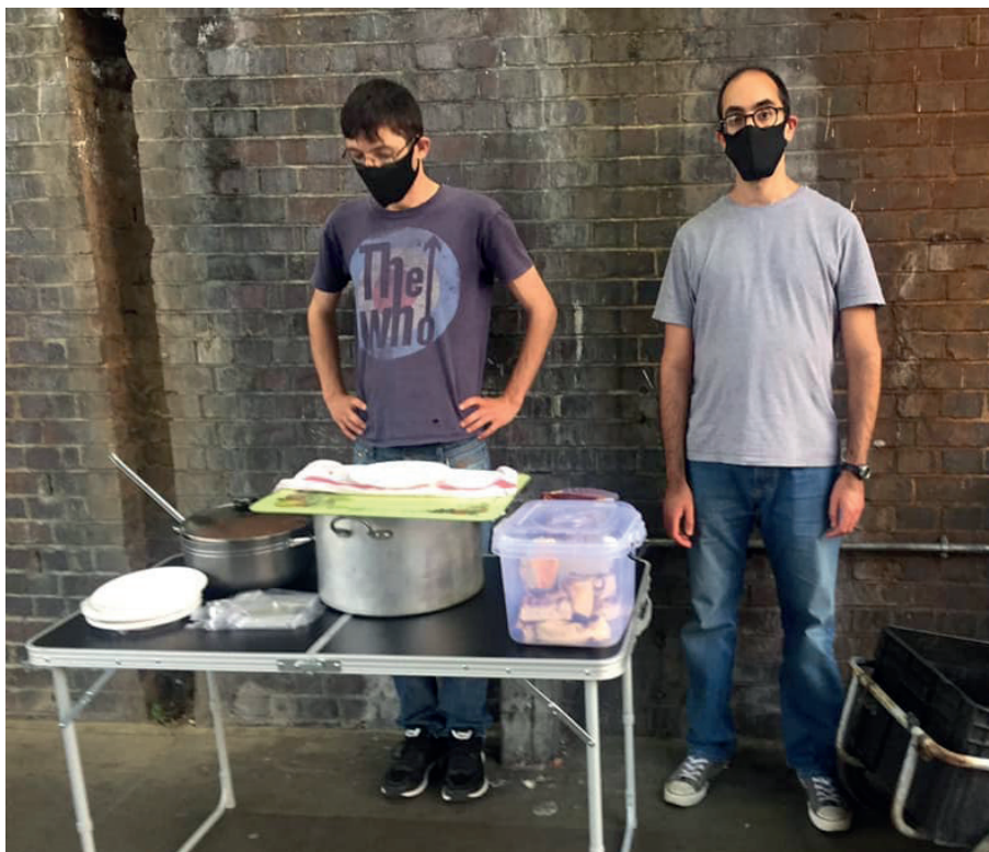
Above: Volunteers from Giuseppe Conlon House serve free food in Haringey at the new Friday Free Food project.