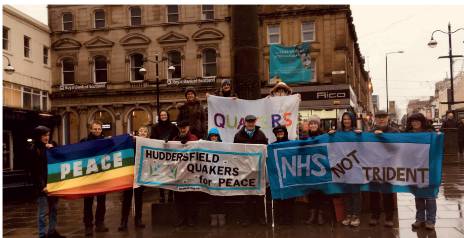
Above: Quakers take part in a monthly vigil in Huddersfield town centre. Sadly, one of their number, a local vicar, died of the virus early in the pandemic.