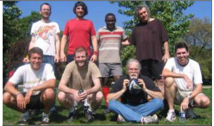
Above: Saturday morning CW football team - spot the ringer!

Saturday morning football: 10.30am Finsbury Park-corner near Manor House Tube station: check first before coming