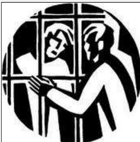
Above: Visiting the prisoner - by Ade Bethune

So the big picture on one level is this: Governments have ever more information about pretty much everything: that