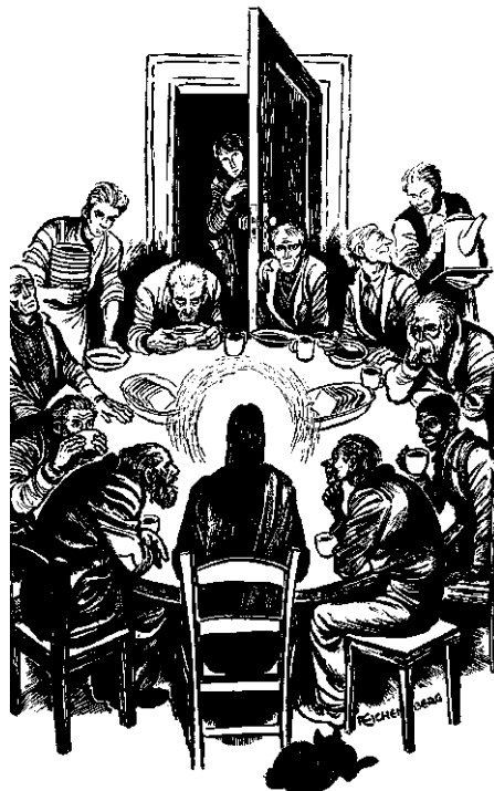
Fritz Eichenberg, The Last Supper