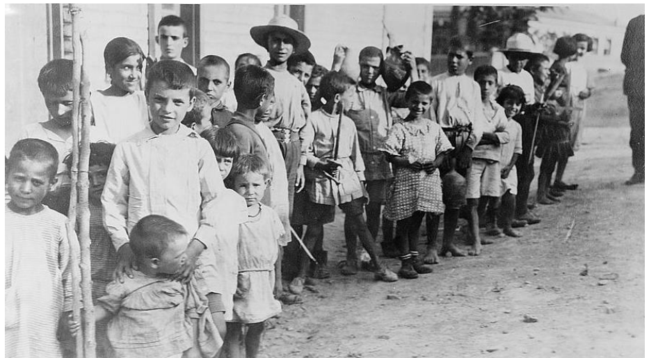
Greek and Armenian refugee children near Athens, Greece, following their expulsion from Turkey 1923 Public domain

The 'scum of the earth' are people reduced to their humanity, to mere existence; stripped of all the qualities that would allow them to be recognized, and recognize themselves, as equal human beings. This is the situation now of undocumented migrants in Europe, the people who lived in the 'jungle' camp in Calais, and many people living with no