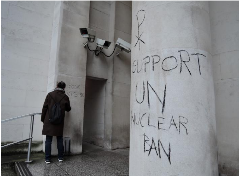
Marking the MOD stonework with charcoal, 'Support UN Nuclear ban' on Ash Wednesday