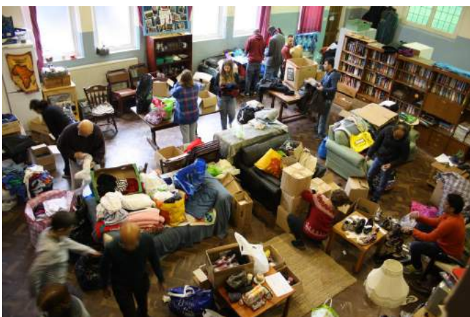
Sorting donations for Calais at Giuseppe Conlon House

We pray for all those gathered there in the face of such grave mistreatment and injustice.