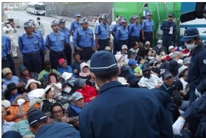
Japanese protestors lie down in the road to block construction of the new US base, Camp Schwab at Ourawan Bay, Okinawa

Around one hundred and fifty Japanese protesters have gathered to stop construction trucks from entering the US base, 'Camp Schwab', after the Ministry of Land over-ruled the local governor's decision to revoke permission for construction plans, criticizing the Japanese government of compromising the environmental and health and safety interests of the islanders.