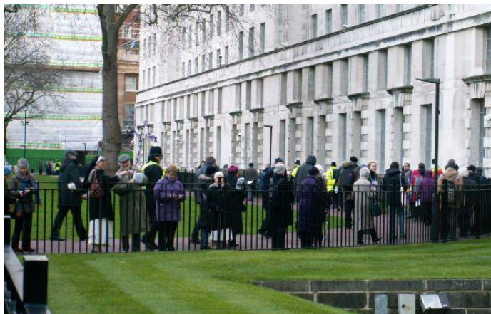
The Ash Wednesday witness processes round the back of the MOD, scattering seeds.