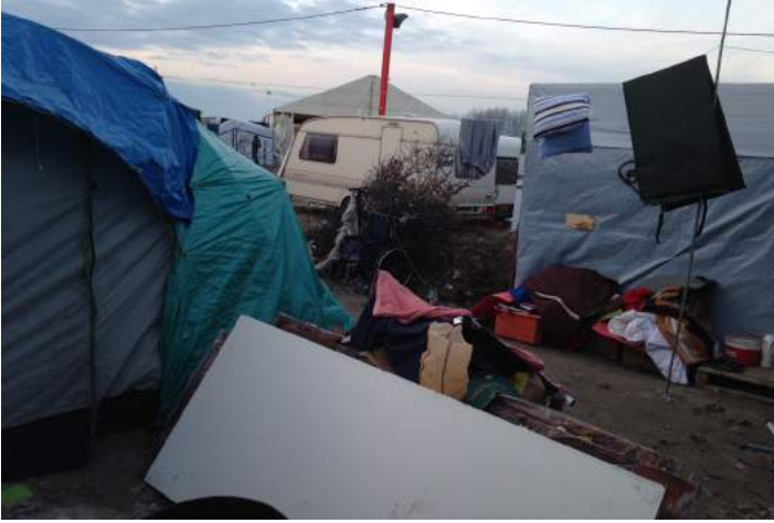
Dwellings at the 'jungle' refugee camp in Calais

For us in the UK, Calais is no longer simply a place known for its ferry port and the cheap wine that you can buy there. It has become a place that lays bare, on one hand, Britain's response to Europe's so called 'refugee-crisis', and, on the other, how devastating the consequences of a fortified Europe are.