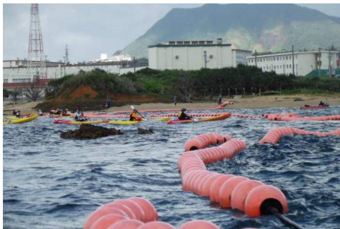
'Kayaktivists' protest the construction of Camp Schwab, the new US base at Ourawan Bay, Okinawa