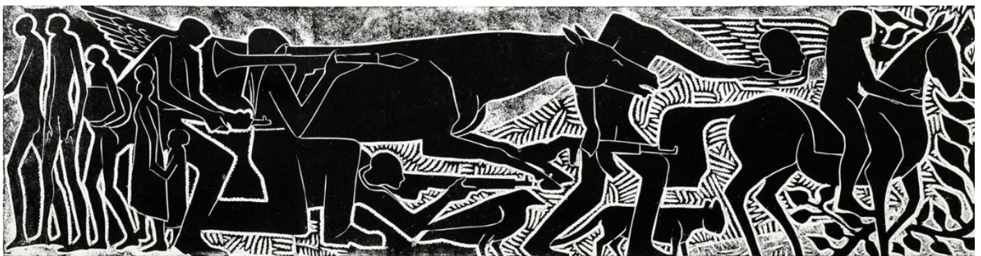
Untitled , Mustafa al-Hallaj, 1980