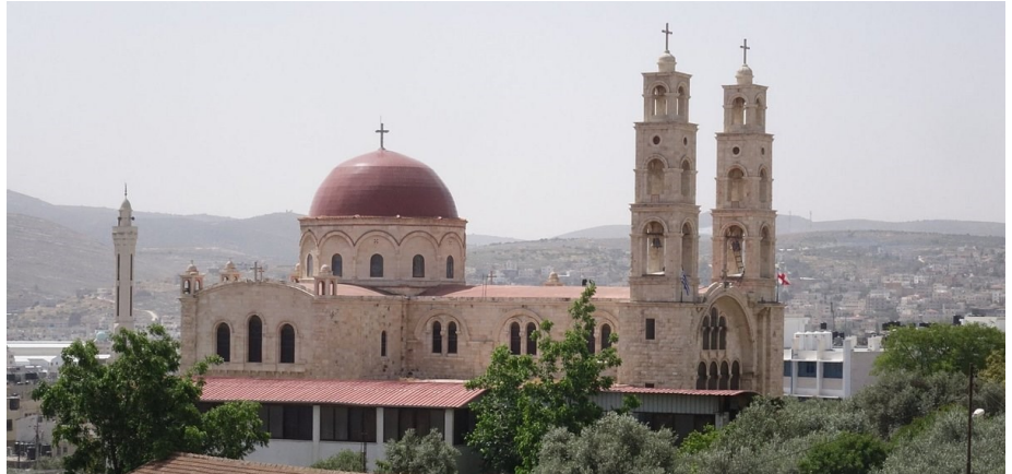
The Church of Jacob's Well, Nablus

I went to Palestine, to the city of Nablus in the West Bank (under Israeli military occupation) for a holiday, from September 18th to October the 6th – one day before the Hamas attack and the ensuing genocide Israel is carrying out against the trapped people of Gaza.