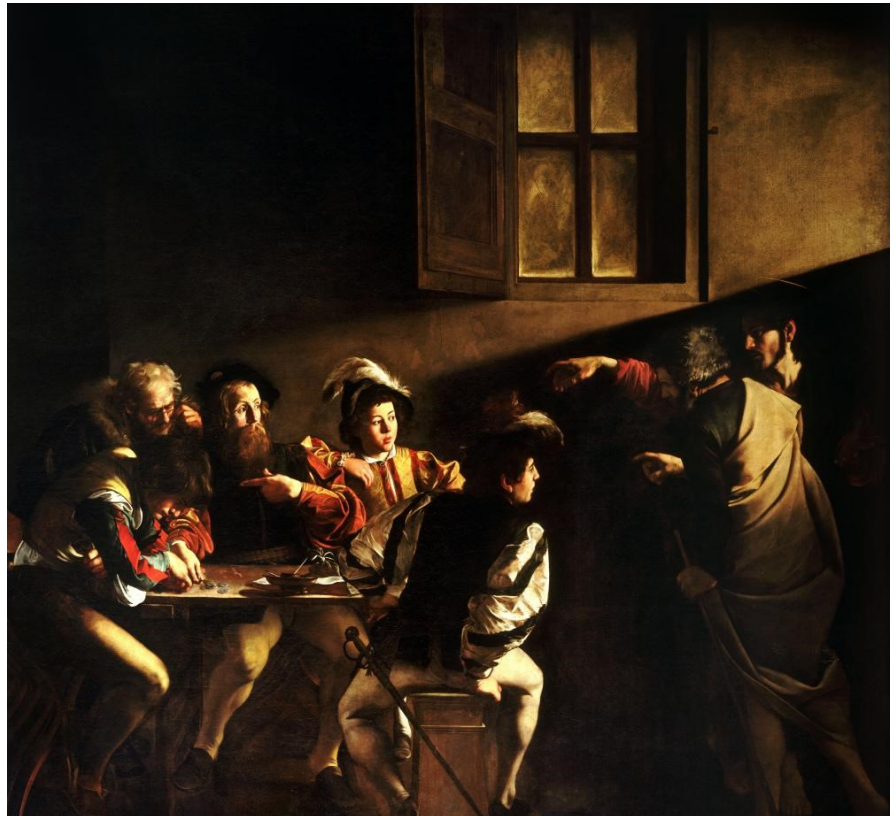
The Call of Matthew, Caravaggio, 1600

Living and working among refugees and migrants is a help in understanding these things. So is trying to live the voluntary poverty that Dorothy Day and Peter Maurin talked about. They did not mean destitution. St Francis talked about Lady Poverty. It is a call to conversion away from the comforts and material addictions of our culture.