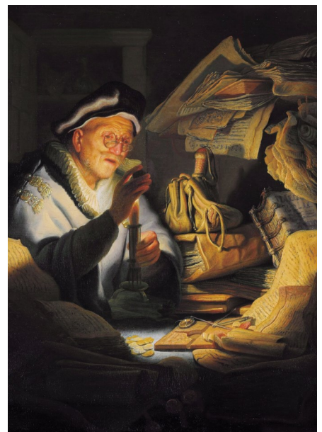
Parable of the Rich Fool, Rembrandt, 1627