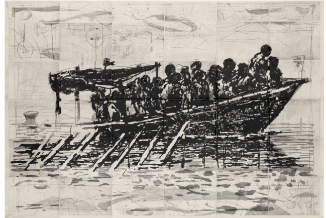
Refugees, William Kentridge, 2018

Days later, I happened to be one of the people on shift with the Alarm Phone. The Alarm Phone primarily exists to support migrants crossing the Mediterranean – people travelling, usually already at sea, can call the number, and if they are in distress the team on shift can relay information about the boat to coast guards which are generally reluctant