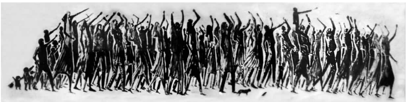
Untitled, Mustafa al-Hallaj