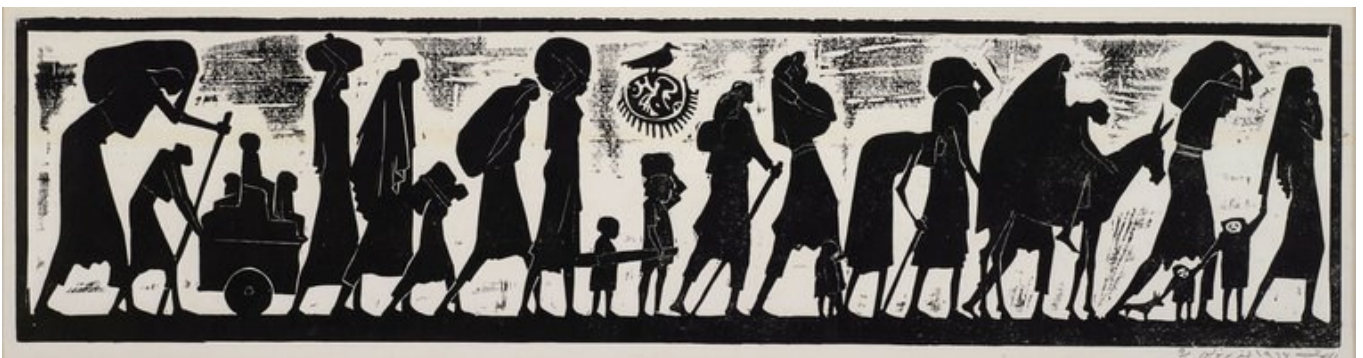
Untitled , Mustafa al-Hallaj, 1967